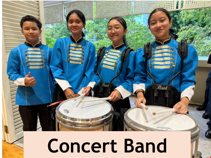
Concert Band Certificate of Distinction