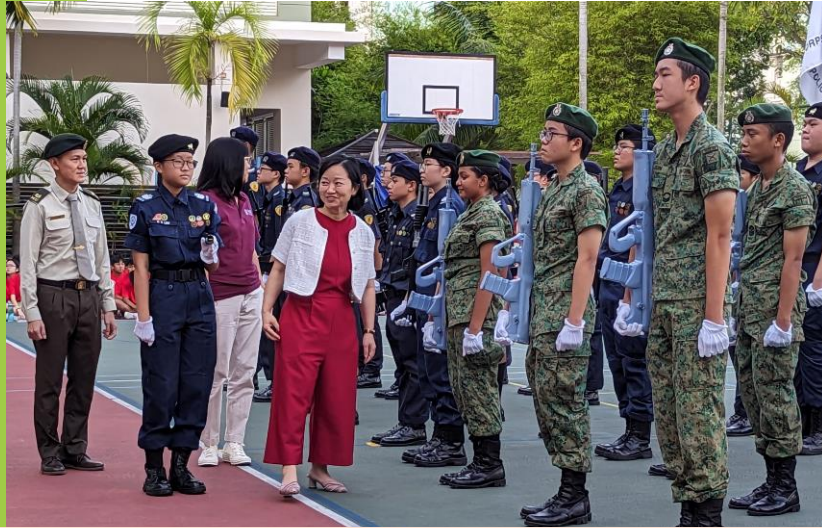
NCC - Unit Recognition Award - Distinction