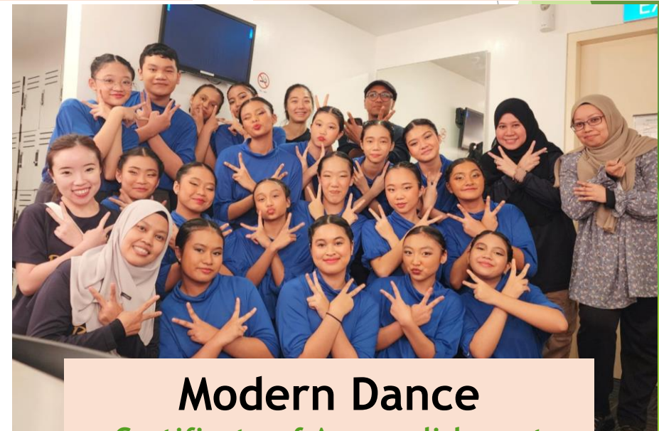
Modern Dance Certificate of Accomplishment