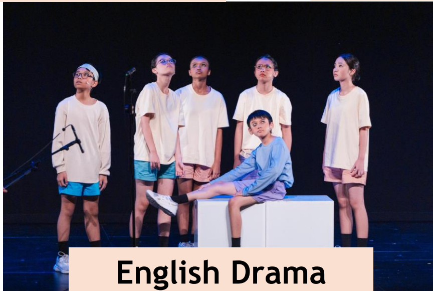
English Drama Certificate of Distinction