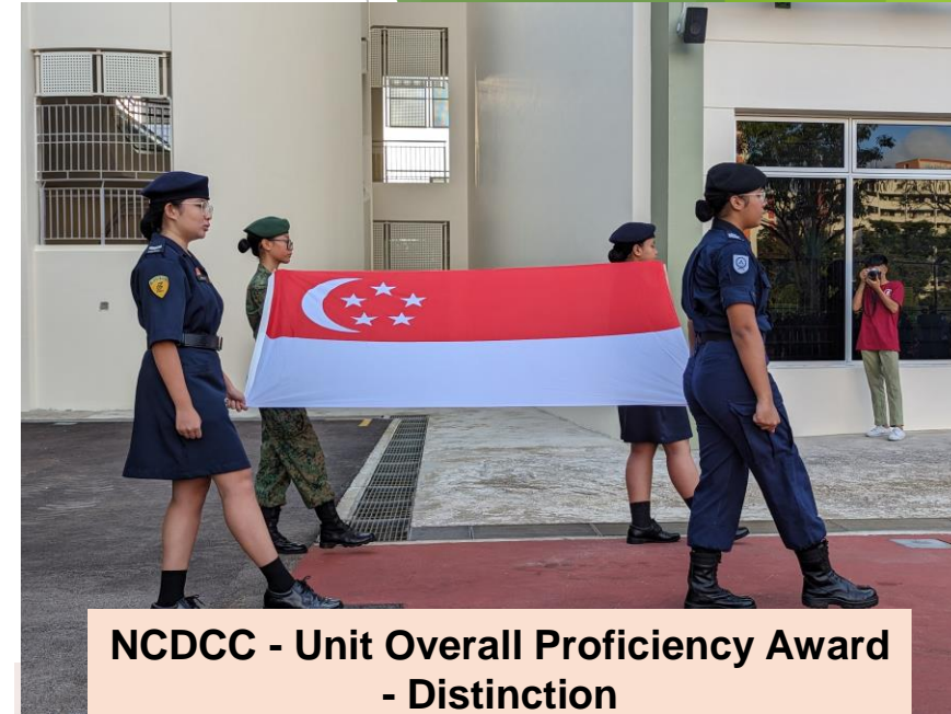
NCDCC - Unit Overall Proficiency Award - Distinction