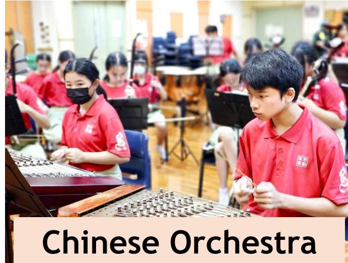
Chinese Orchestra Certificate of Distinction