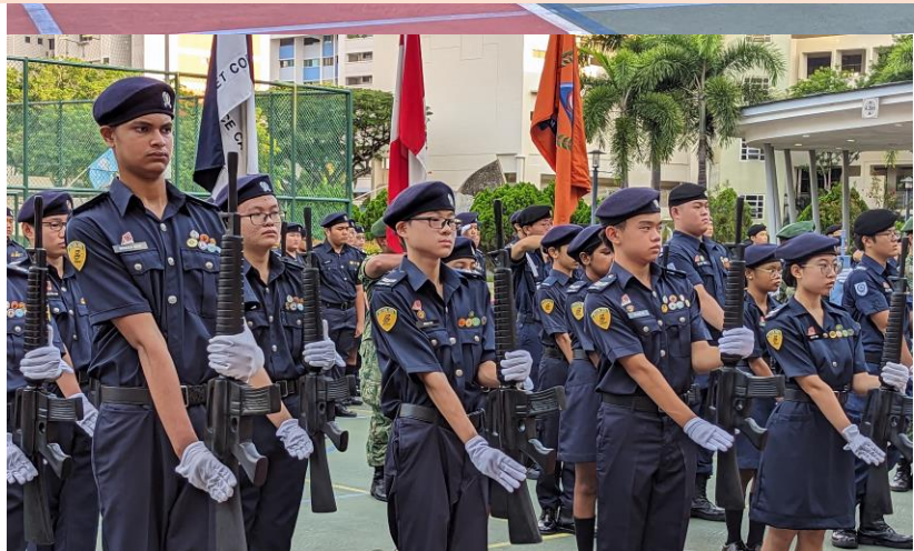
NPCC - Unit Overall Proficiency Award - Distinction