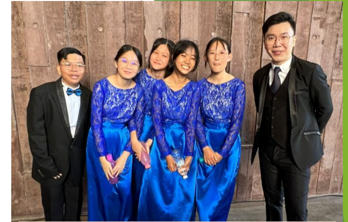
Choir Certificate of Distinction