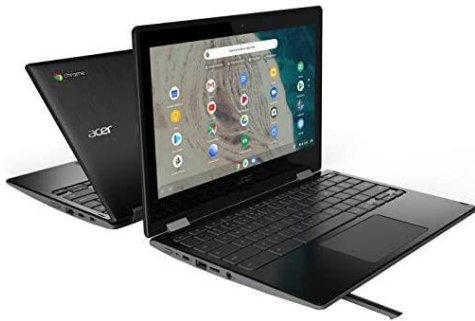
Acer R753TN Chromebook $548.64